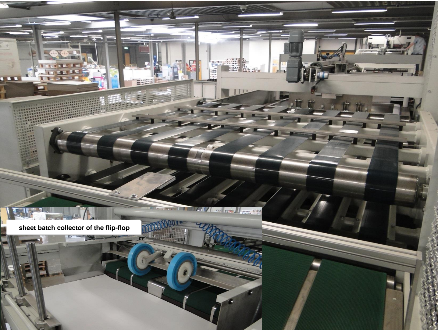
sheet batch collector of the flip-flop