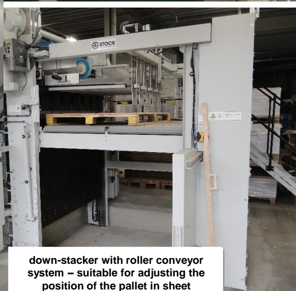
down-stacker with roller conveyor system – suitable for adjusting the position of the pallet in sheet direction