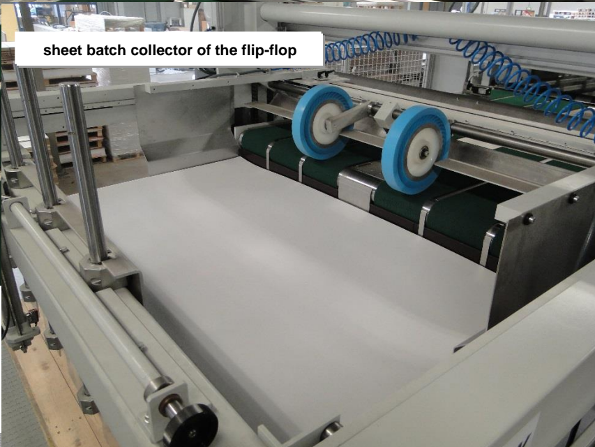
flip-flop (batch-pile turner) incl. a sheet batch collector - adjustable batch height