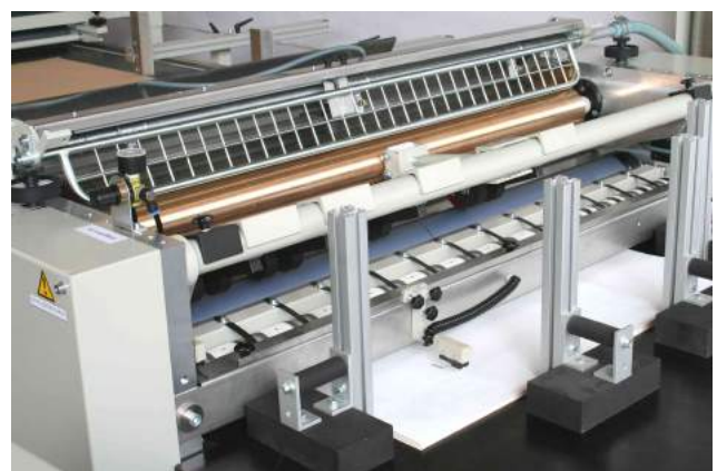
Gluing unit with pre-connected label feeder