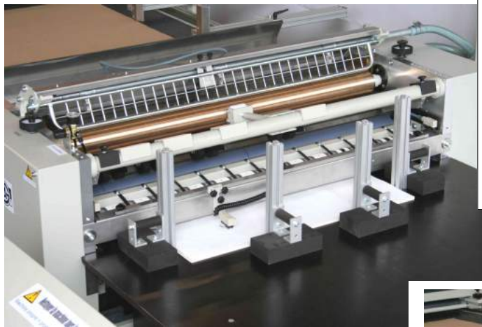
Label feeder: Single sheet feeding

The manual labeler is specifically designed to allow your market entry by keeping the investment affordable.