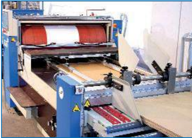
Board feeder: Lead edge suction feed. Independent driven suction belts ensure constant and accurate blank feeding.