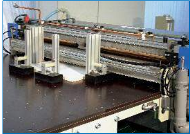
Lead edge label (printed sheet) feeder: Independent suction sleeves operate on a suction head providing fast set-up time and consistent label feeding.

The LLM /HP capable of labeling litho printed labels to RSC boxes and substrate blanks for the purpose of producing value-added point-of-purchase packaging. The process of adding a litho printed sheet to one or more panels of a brown box is one of the most cost-effective ways of turning a box into an informative sales tool. It is possible to use the machine for spot and full sheet labeling as well. A new special pre-registration system for the substrate blanks allows a tight register for full sheet mounting.