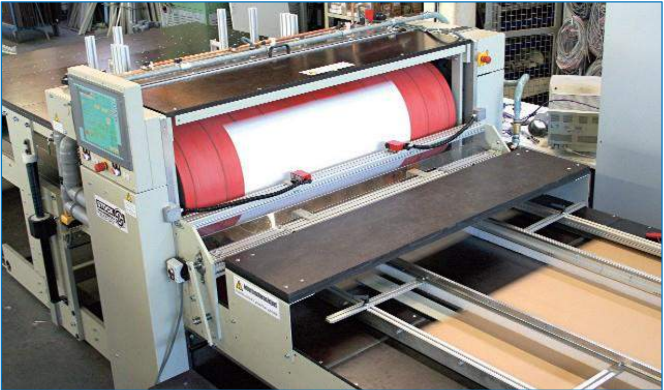
Label application cylinder: vacuum cylinder transfers the glued label to the corrugated blank, label control by laser detectors.