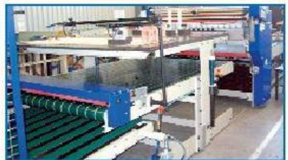
pallet / roller conveyor